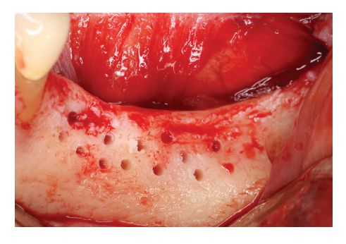
1. Labial view of an atrophic posterior mandibular area.