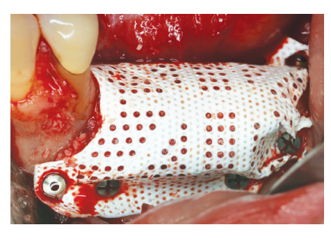
3. An RPM is secured over the graft with titanium pins and screws.